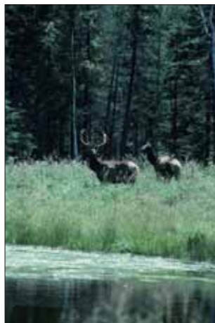
Red Deer, Alberta

Quick delivery time, service and support were key factors to win this bid but the biggest challenge was Red Deer's environmental conditions, where crazy temperatures are the norm all year long; winter temps can fall to -35 Celsius one day and reach +5 the day after with the same phenomenon in summer; a day at +35 and another day at +2. Only a reliable terminal can withstand such climatic extremes. Cale Systems took up the challenge, using its MPC solar powered unit, strong enough to absorb the shock and fulfil customer needs.