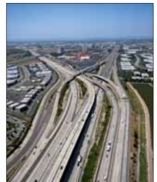
San Diego Freeway, CA

2010 has started off very well for Cale's US partner, Cale Parking USA. The County of Alameda, CA , who recently issued a tender for terminals and service, awarded a three year contract to Cale USA. San Diego, CA, Kirkland, WA, The State of New Hampshire, Indian Shores, FL, Arlington, VA , and many more customers have also recently added terminals to their installed base. Cale USA's private operator partners at Colonial Parking and LAZ Parking have also added to their own installed bases, and foresee future orders in the coming year.